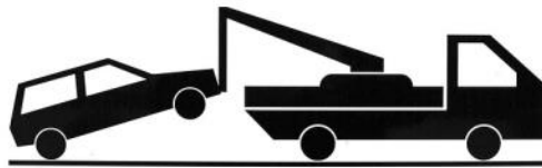
A car being towed by a tow truck

When a car is badly damaged so that it can't be driven, then it needs to be towed – transported by another vehicle, which is called a tow truck . (Your car can also be towed if you park in a prohibited area).