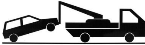
A car being towed by a tow truck

When a car is badly damaged so that it can't be driven, then it needs to be towed – transported by another vehicle, which is called a tow truck . (Your car can also be towed if you park in a prohibited area).